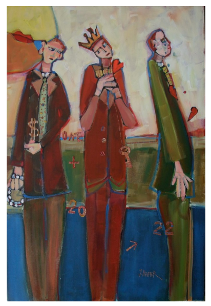
42. Genevieve Pfeiffer Wisdom of A.E Housman 36 x 24", Acrylic & Collage