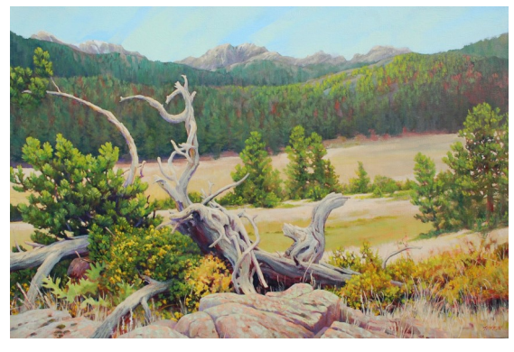
55. Jack Turpin High Country Resting Place 24 x 36", Acrylic

53. Kathleen Theriault Come This Way 30 x 36", Mixed Media