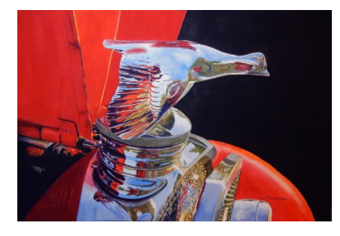
1. Gloria Ainsworth Mout Classic Ford Hood Ornament 14.5 x 21.5", Watercolour