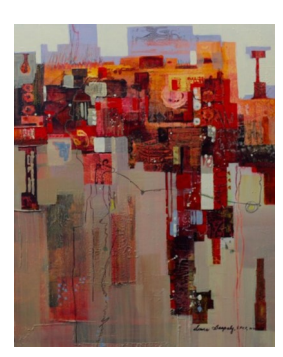
5. Donna Baspaly Connections 20 x 16", Mixed Media