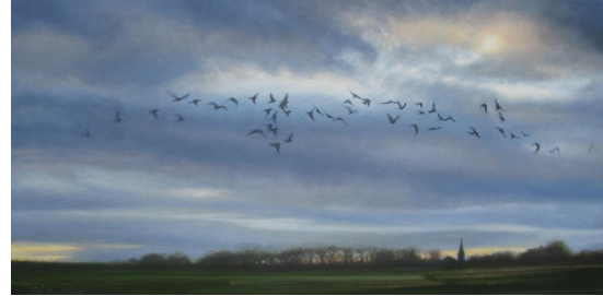
38. Gale More O'Ferrall Frolicking 18 × 36", Oil 39. Suzanne Northcott Oriental Swan