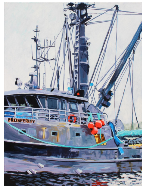
59. Nancy Yip Les Baleines 21 x 13.5", Watercolour