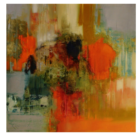
27. Rose-Marie Kossowan Introspection 30 × 30'', Oil