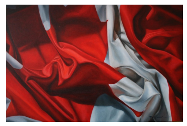
2. Fran Alexander Beaming White and Red 24 × 36", Acrylic