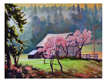
21. Don Hodgins Ruckle Barn 11 x 14''', Oil