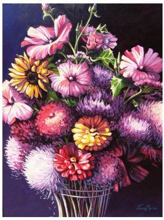
37. Joane Moran Mary's Bouquet 30 x 24'', Oil