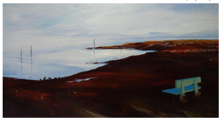
40. Patricia Peacock Dawn at Blackie's Spit, Crescent Beach 26 x 48", Acrylic