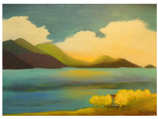
25. Jutta Kaiser Homestead 30 x 42", Acrylic