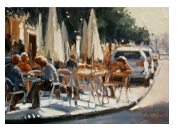
26. Sarah Kidner Morning Coffee Study 12 x 16'', Oil