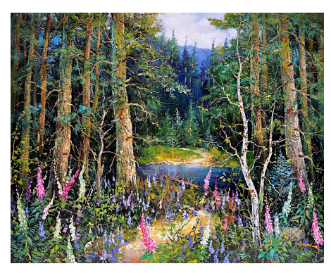
10. Tinyan Chan Woodland Trails 24 × 30", Oil

9. Barrie Chadwick The Western Point 36 x 36", Acrylic