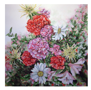
43. Karen Poirier A Beautiful Moment 17 x 17.5", Watercolour