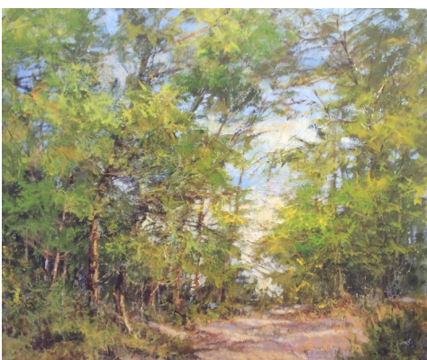
24. Amanda Jones Woodland Trail 30 x 36'', Acrylic