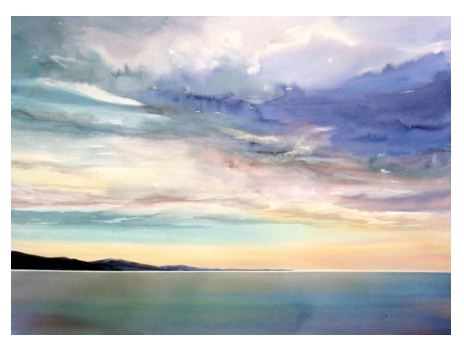
4. Enda Bardell Beginning 20 x 28'', Watercolour