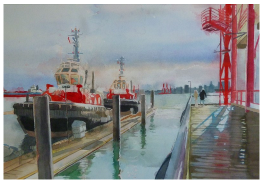
41. Sandrine Pelissier Tugboats 22 x 15", Watercolour & Mixed Media