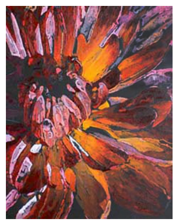
15. Colleen J Dyson ASTERACEAE 28 x 22", Oil