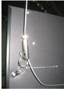
Medium 3/4" eyelet with split ring