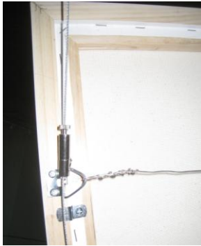
Large 1" eyelet not needing split ring

Below are photos of the types of eyelets to be used. These make it possible for the CVAA Hanging Committee to hook them onto the pre-existing hanging system installed at the gallery as shown. Eyelets should be a minimum 4" below top of frame.