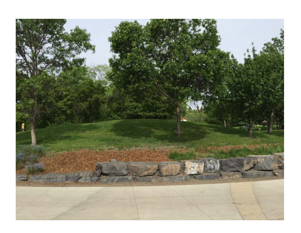
Site 13: Hillside On The Way to Beaver Lodge (1)

This retaining wall and grassy hillside is on the way to the beaver lodge and ultimately Arctic Shores, just sitting west of site 12. This will be labelled '# 13' on the map.