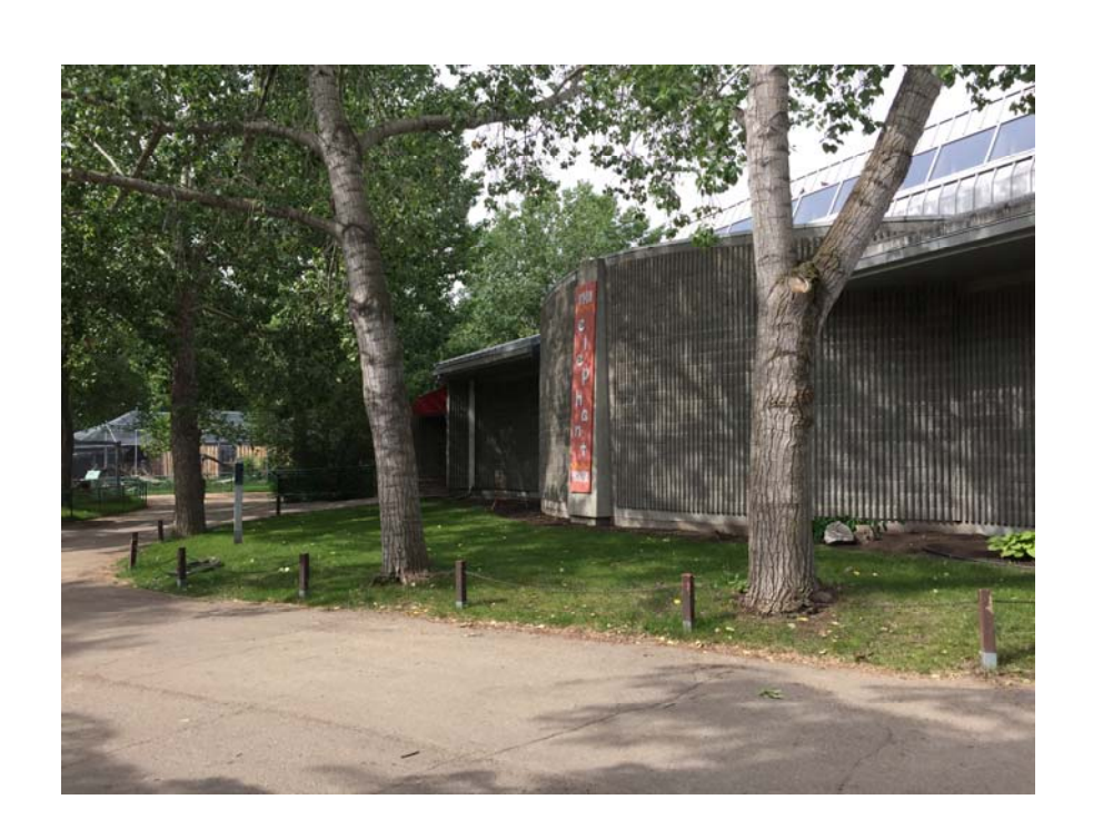
Site 9: Lucy the Elephant Enclosure Entrance (1)

Although the front area of the Elephant enclosure is small, it gives ample opportunity to take advantage of a high traffic area as Lucy is one of the most popular attractions. It has a large amount of through foliage and wall opportunities. This will be labelled '# 9' on the map.