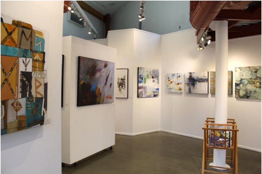
Cover Image – The Small Artwork Collection displayed with the Abstract Exhibition 2018

No submission deadline. Open all year! Free to submit Open to Active and Signature Members