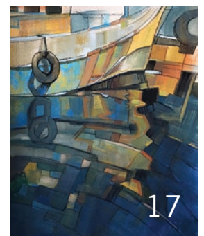
17 2018 Artist's Choice: Karen Kato Rempel Reflecting on a distant reality mixed media on paper, 15" x 11"