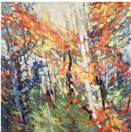
3RD PLACE: SHEILA DAVIS Leap of Faith oil on panel, 48" x 48"