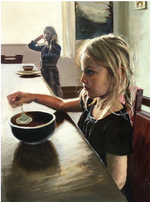
2ND PLACE: DAVID VEGT Sunday Soup oil on birchwood, 24" x 18"

HONOURABLE MENTION: BRIAN EBY Waiting for the Light at Niagara St oil on canvas, 30" x 24"