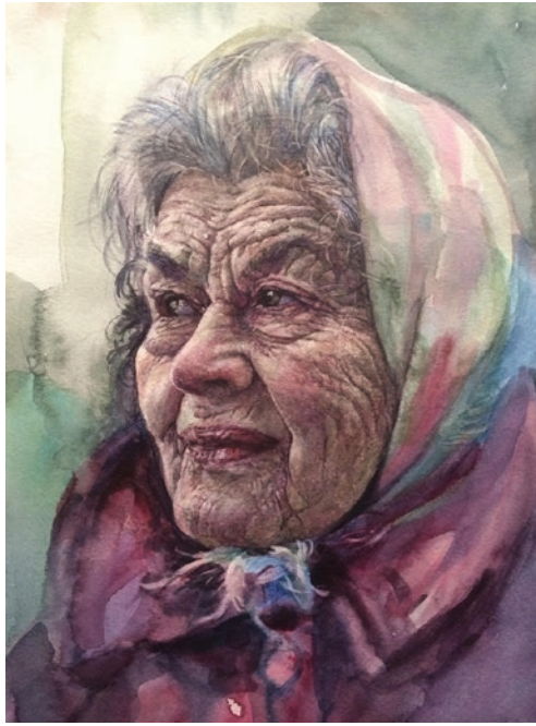
2ND PLACE: NICOLETTA BAUMEISTER, AFCA Alida watercolour on paper, 11" x 8"

FIRST PLACE (COVER): MEETA DANI Treasured Memories watercolour on paper, 15" x 23"