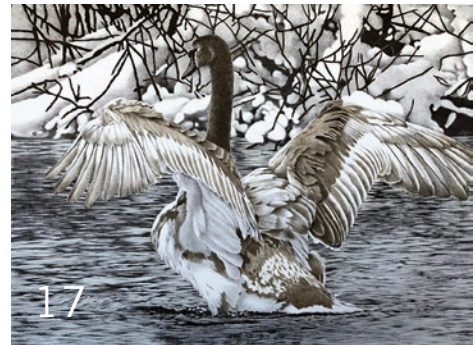
17 SFCA Signature Medals: Elisabeth Sommerville SFCA, Cygnets stone lithograph, 11" x 14"