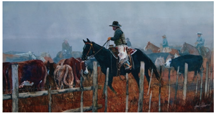
BRONZE MEDAL: HAROLD ALLANSON, SFCA October Morning Fog watercolour, 25" x 46"