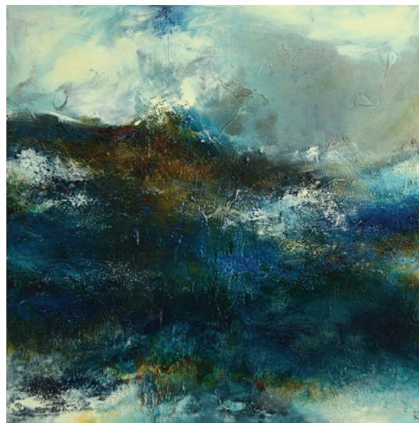
RENATA KERR Into the Light acrylic on canvas, 30" x 30", $760 PURCHASER FROM: Sydney, BC