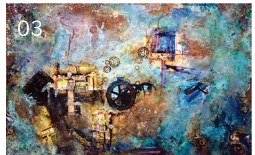
Zohar Fiszbaum, "Picks and Pixels" Show