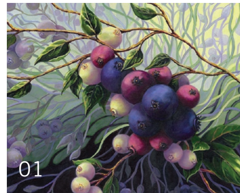
Joane Moran, Wild Blueberries 6