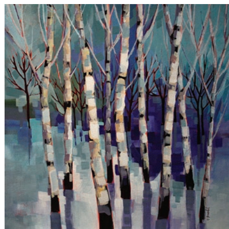
Dawne Brandel, 1212A Untitled