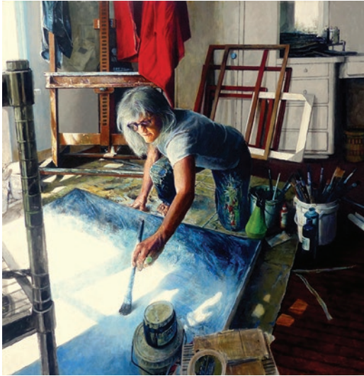
SILVER MEDAL: ALAN WYLIE, SFCA The Artist oil on panel, 34" x 35"