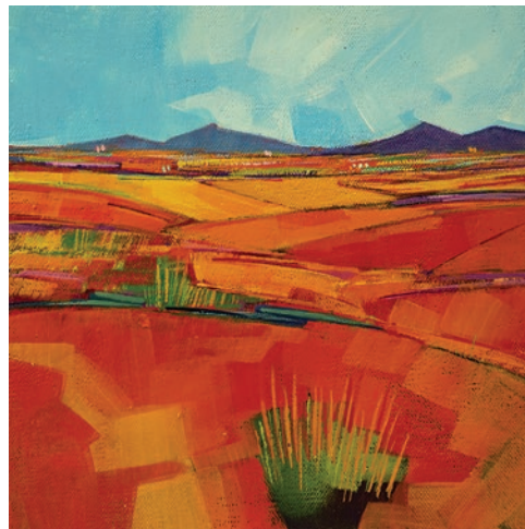
2ND PLACE: RONNIE WATT Summer acrylic on mounted canvas, 8" x 8"