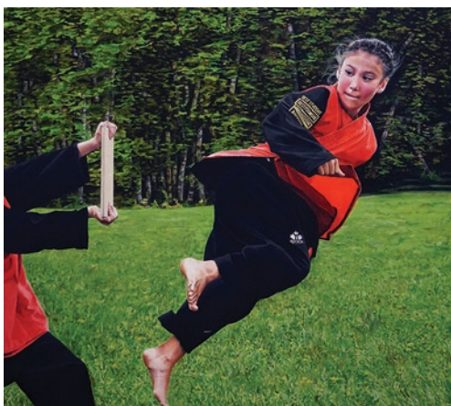
LAARA CASSELLS Yae-Ji acrylic on canvas, 41" x 46", $5500 PURCHASER FROM: Mississauga, ON

NUMBER OF PAINTINGS SOLD IN THE LAST 4 MONTHS 46