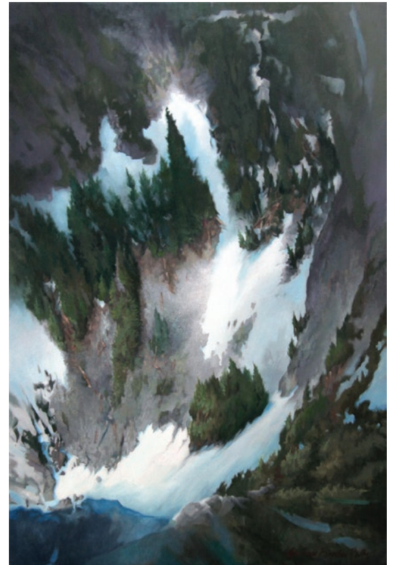
1ST PLACE: GRAHAM BIBBY Meltwater oil on canvas, 36" x 24"