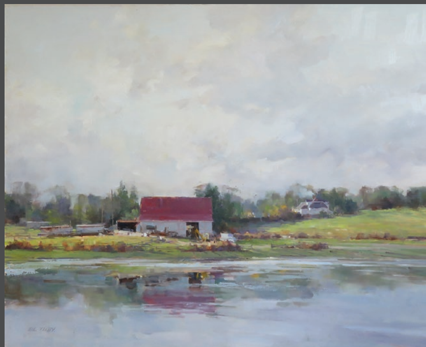
Red Roof Reflected - Final