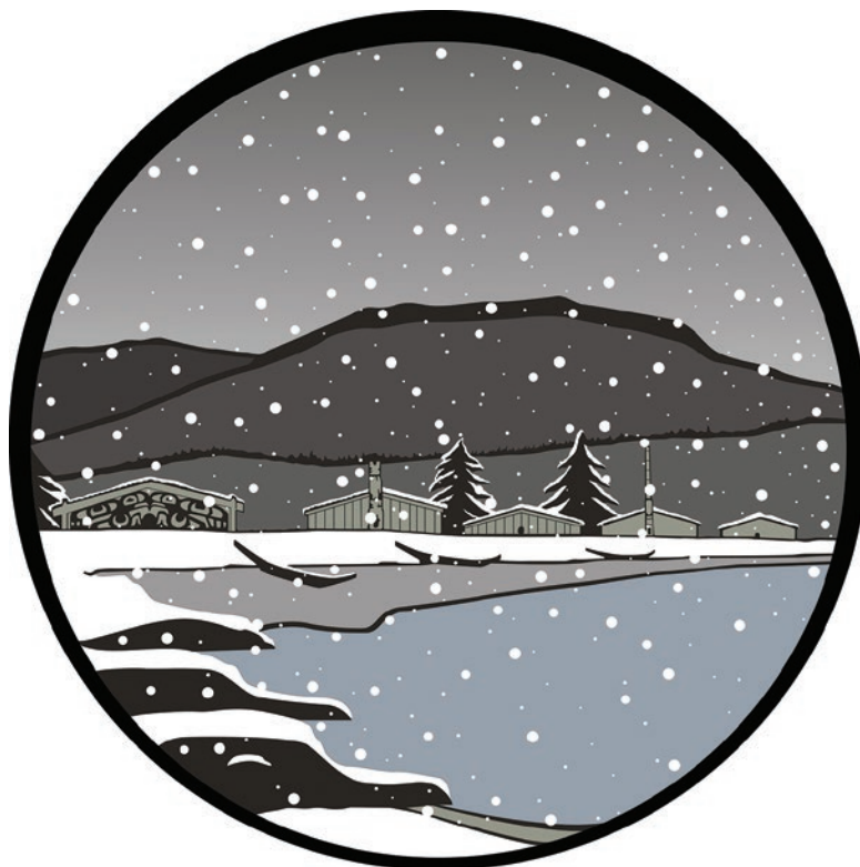
West Coast Winter