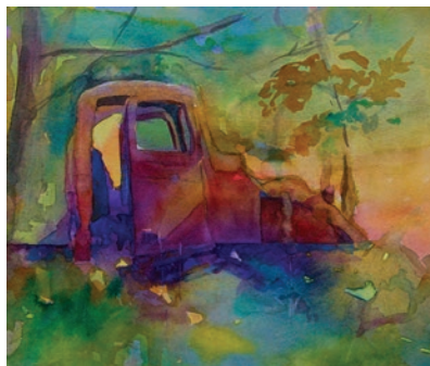
SANDRA IRVINE Aging Gracefully watercolour on paper, 8" x 10", $290 PURCHASER FROM: Carthage, North Carolina, USA