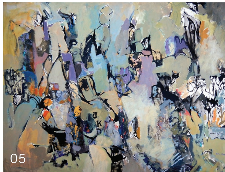
Adrienne Moore, "Clearly Ambiguous" Show