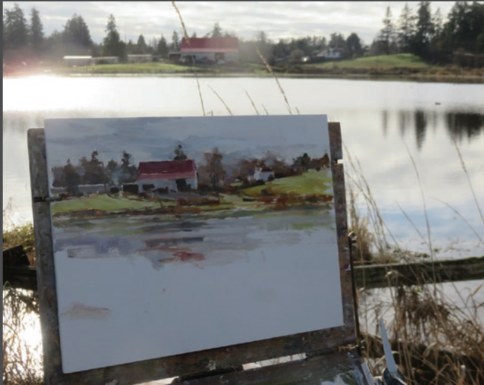
Red Roof field study

Every Monday morning, I get together with seven friends to paint en plein air in various locations around the Peninsula on Vancouver Island, BC. The farm depicted in this oil painting is a favourite subject, especially in the winter when flooding in the fields gives wonderful reflections.