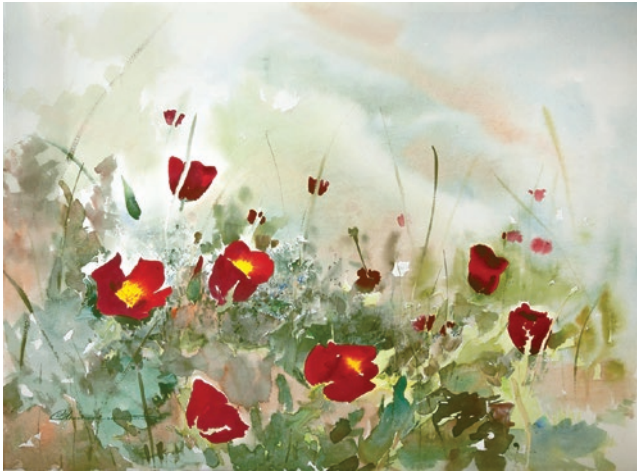
3RD PLACE: MOHAMMADREZA ATASHZAY The Sound of Blooming watercolour on paper, 22" x 30"