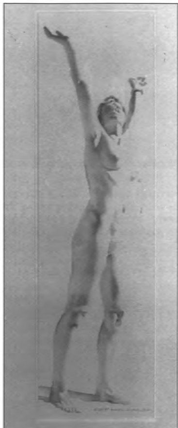
JOY 1 watercolour, 19.5"x5.5" Kiff Holland, FCA AWS SCA