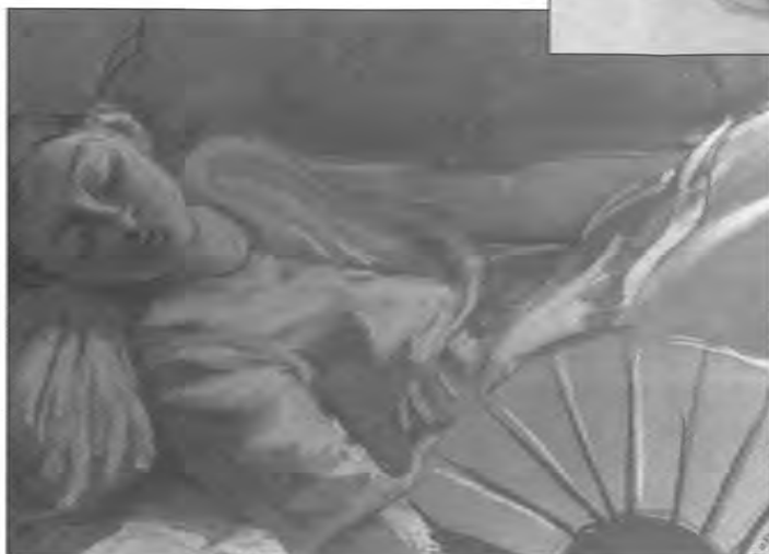
SIESTA pastel, 10"x14" Rita Monaco, AFCA, PPC