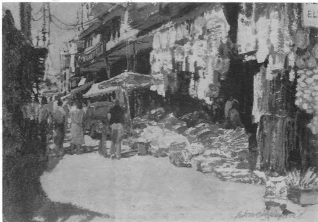
3RD PRIZE TOURIST TRAP acrylic, 11"x14"