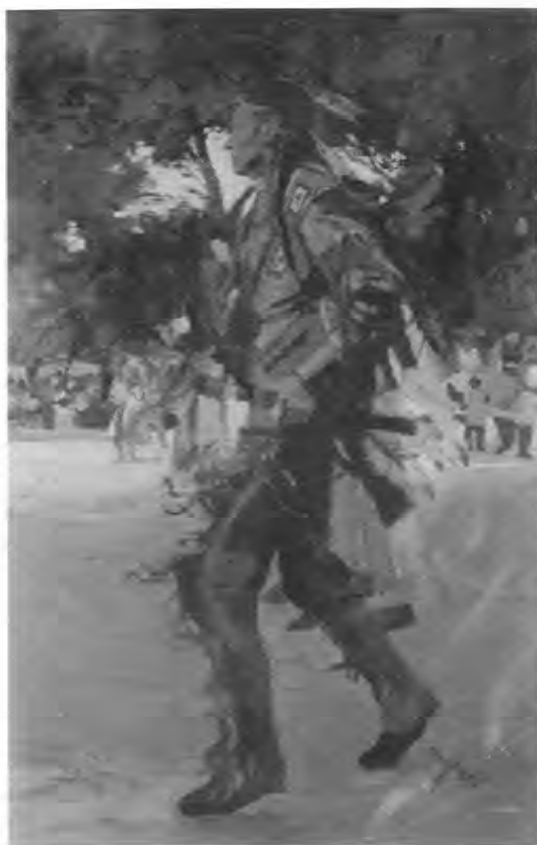
Honourable Mention ALL NATIONS DANCE oil, 30"x40" Neil Boyle, BSWCA