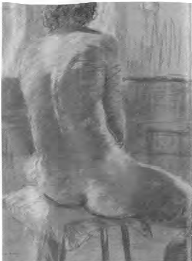
Honourable Mention NUDE STUDY oil and collage Marilyn Atkey