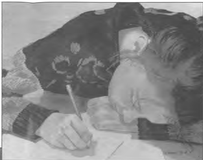
DEAR GRANDAD watercolour, 10"x13" Vera Warmis

Featured on pages 9, 10, 11, and 12 are entries from the FACES & FIGURES Juried Exhibition