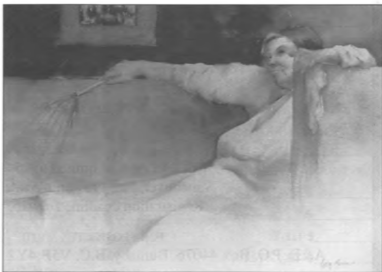
TWO MINUTE BREAK II watercolour, 10"x14" Lila Menagh