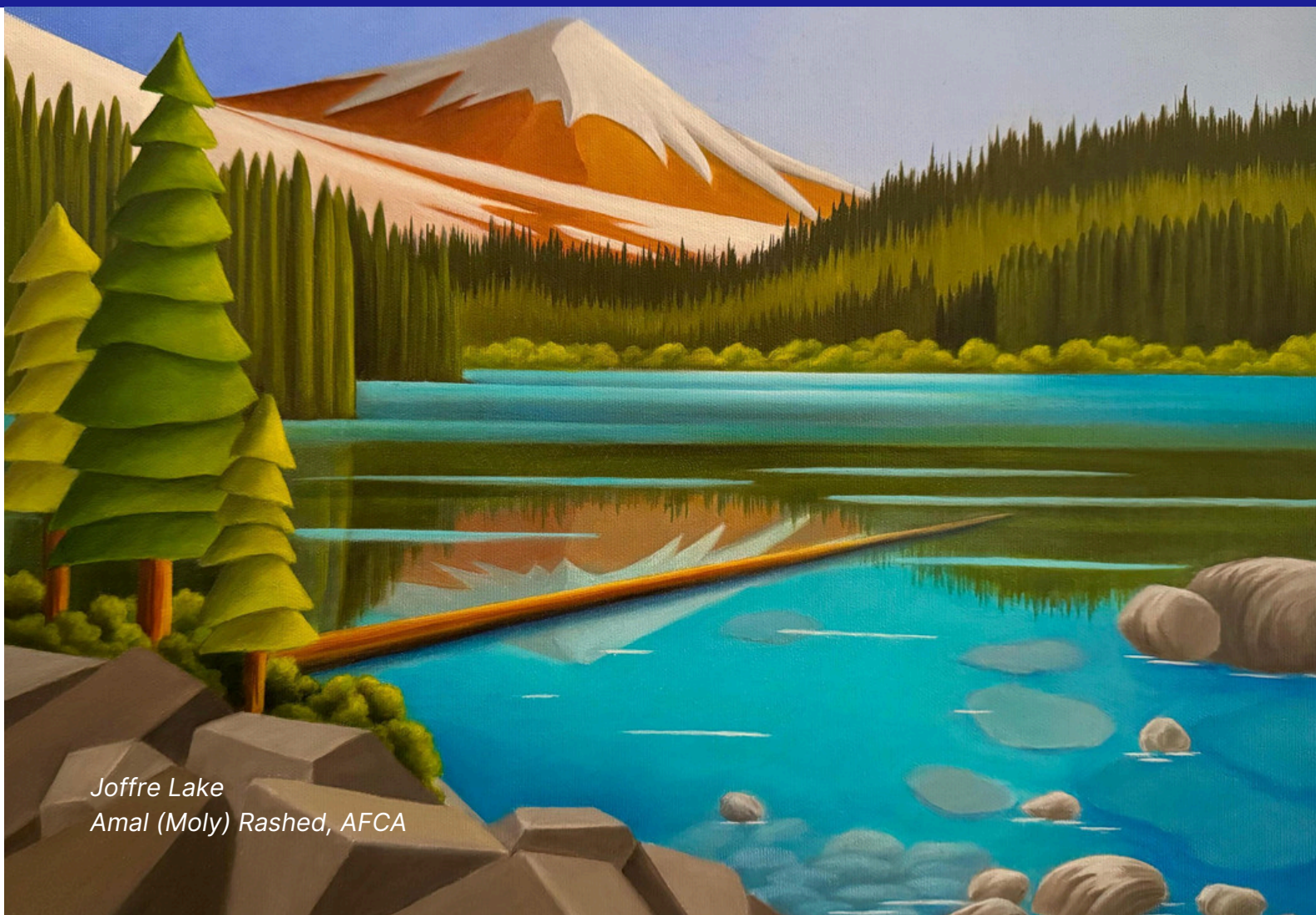
Joffre Lake Amal (Moly) Rashed, AFCA